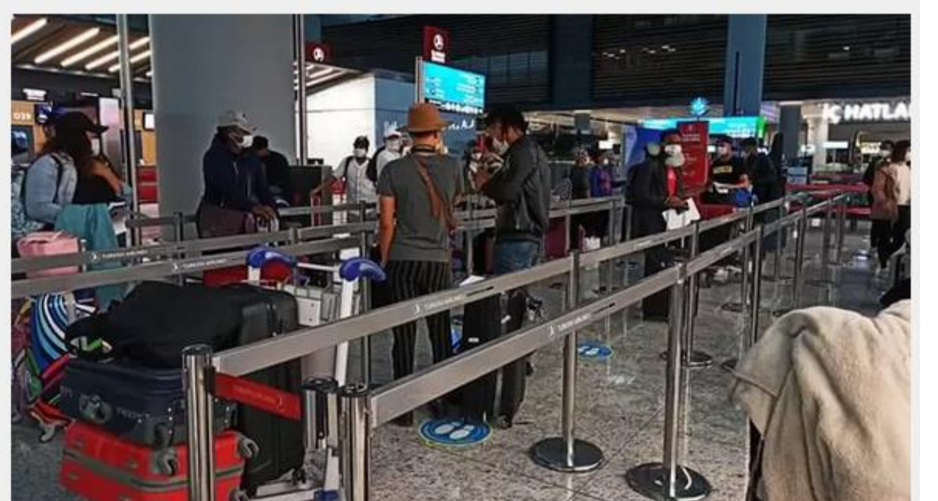
Twenty-nine artists and musicians who had been stranded in Turkey returned to South Africa at the weekend, in a co-ordinated trip.